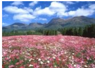
Image: Kuju Flower Park