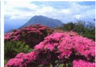
Image: Mt. Tsurumi