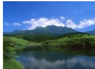
Image: Kuju Highland