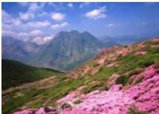
Image: Kuju Mountain Range